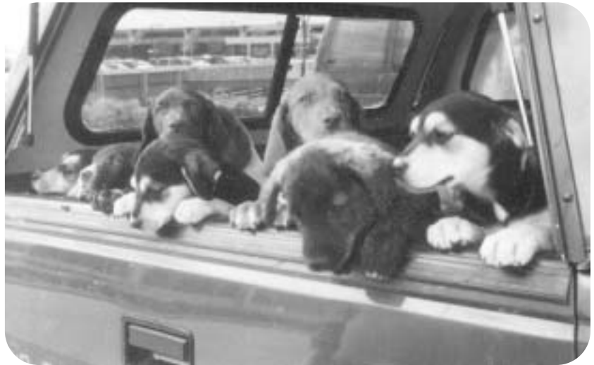
You can help puppies like these little guys, along with kittens, cats and dogs, just by driving your car! Thanks!

W ant to know how you can help animals where you live? Does your state have an “animal-friendly” license plate? By purchasing one in YOUR state, you can participate in the efforts to reduce pet overpopulation. The proceeds from the sale of these plates go into a fund for spaying and neutering animals. It’s a great way for animal lovers to help animals!